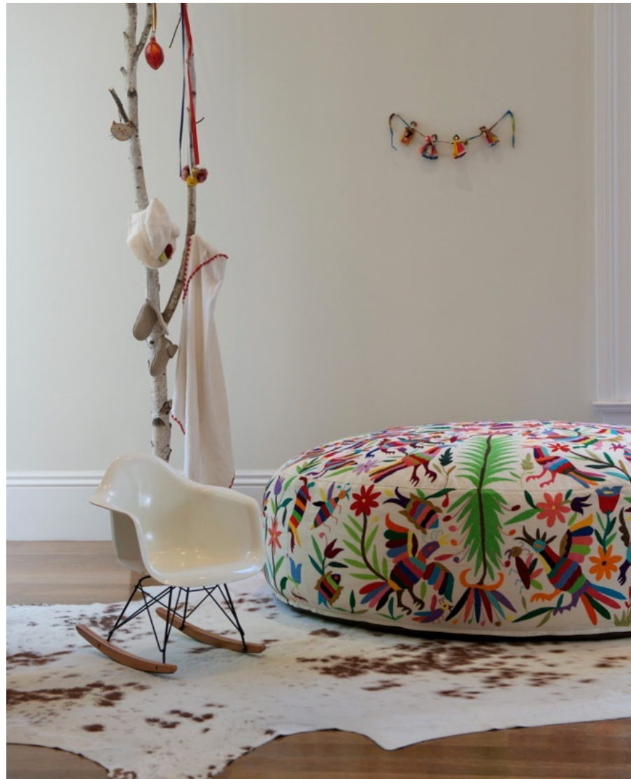
LARGE LOUNGER MULTI COLOR ON COTTON