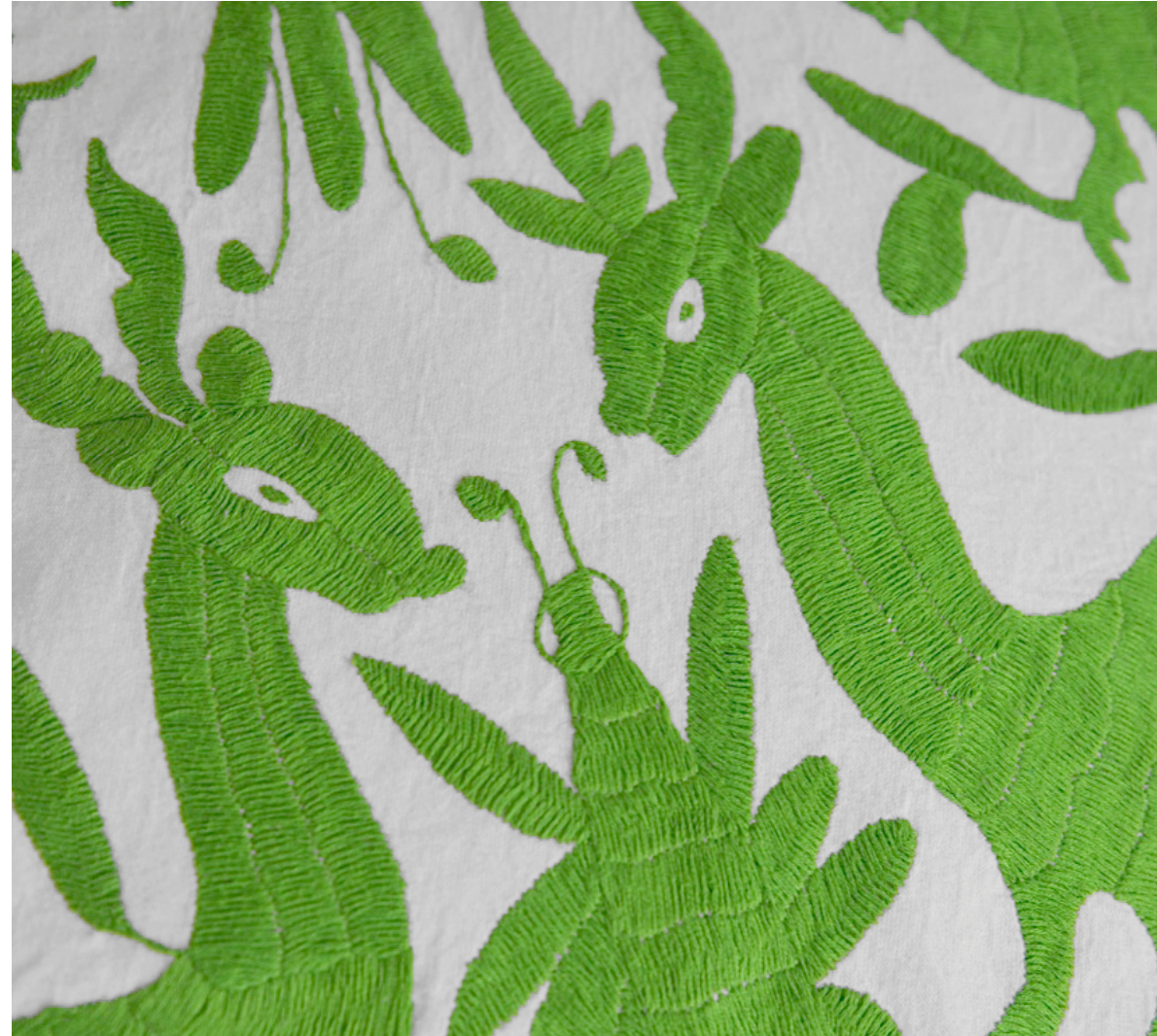
LARGE LOUNGER SHOWN IN BRIGHT GREEN