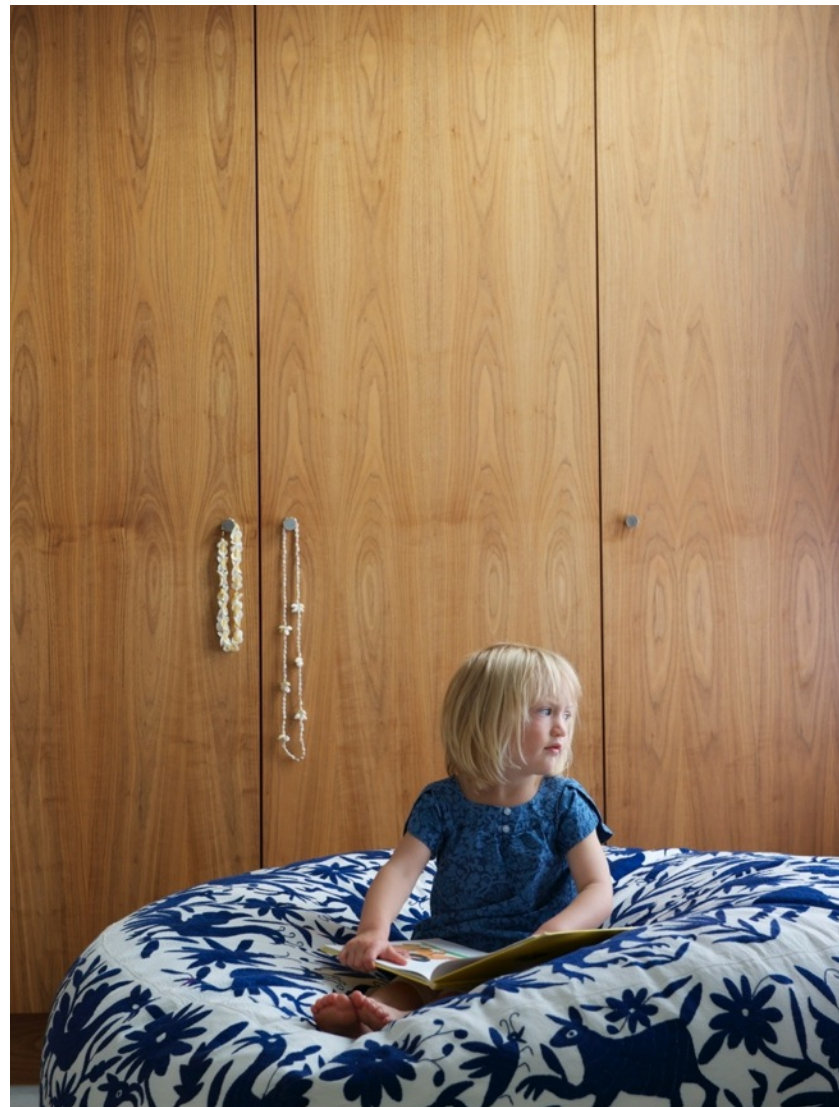
LARGE LOUNGER SHOWN IN NAVY