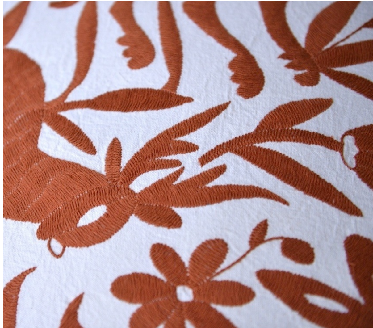
LARGE LOUNGER SHOWN IN TERRA COTTA