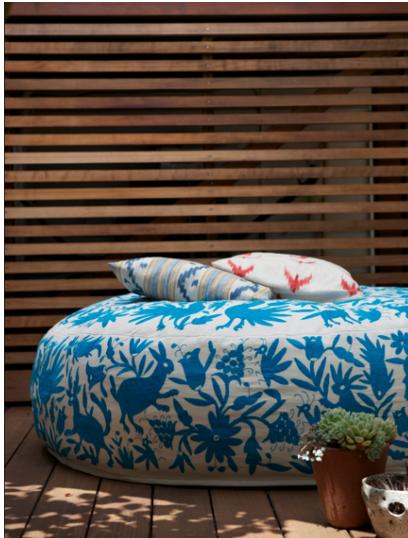
LARGE LOUNGER SHOWN IN TURQUOISE